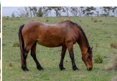
Mega & 1st foal Seraphina, 2000