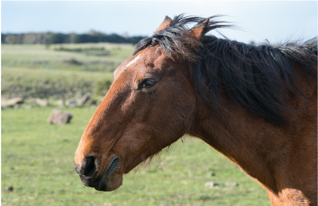
Beautiful old soul Mega